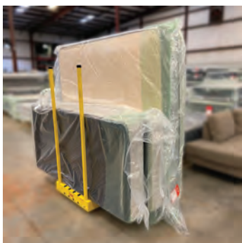
Mattress Shuttle Dolly

This larger version of the yellow Low Safety Dolly has a wider base and increased carrying capabilities. Having a base of 29 in. x 36 in., the Shuttle Dolly is perfect for any warehouse and is customizable for your specific facility needs.