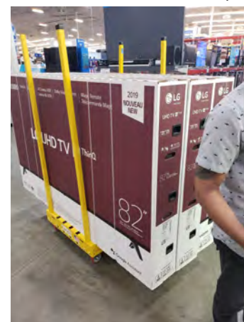
Base Shuttle Dolly